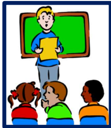
Stage 3 Assembly Friday 1.15pm (Odd Weeks)