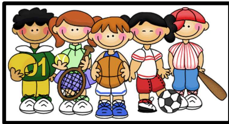
Sport – Friday 1.40pm